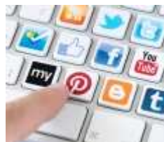
Using Social Media for Job Searching