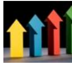
Business Risk Management