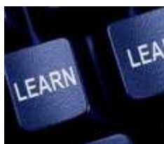
Leading & Managing Change