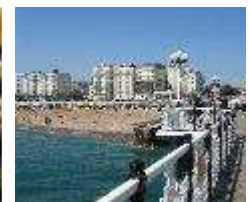
Working With Our Communities