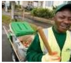
Being an Employee