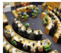
Working in a Political Environment