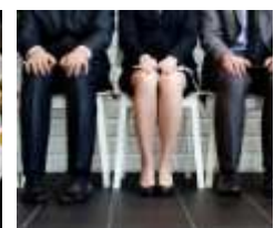
Recruitment & Selection