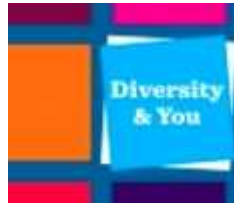
Equality & Diversity