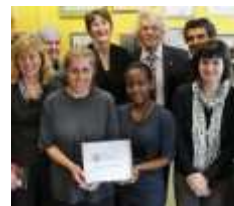
ICS Qualification Overview