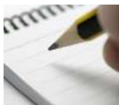
Minute & Note Taking