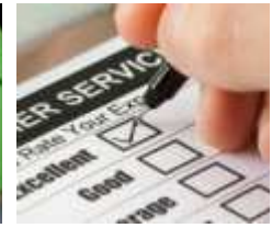
Complaints Investigation Skill & Service Improvement