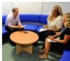
Handling Challenging & Sensitive Conversations