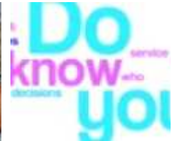
Foundation Learning Programme