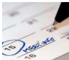
Time Management Skills for Effective Working