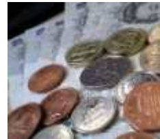
Financial Management for Budget Holders