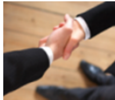
Interview Skills & Confidence Building