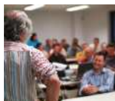
People & Performance Management